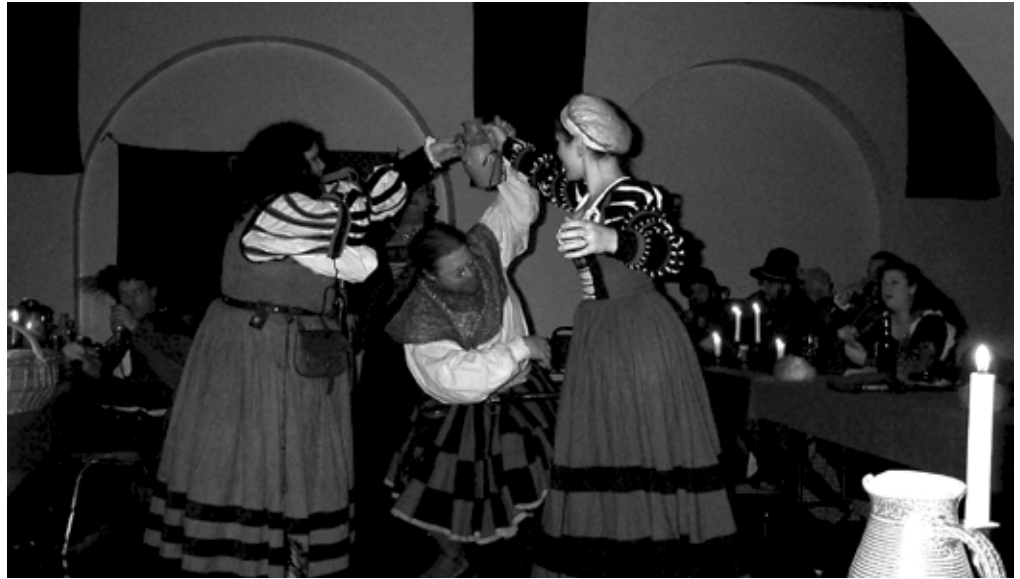
Members of the March of St. Michael perform the Nuremburg Beer Dance for an appreciative audience.