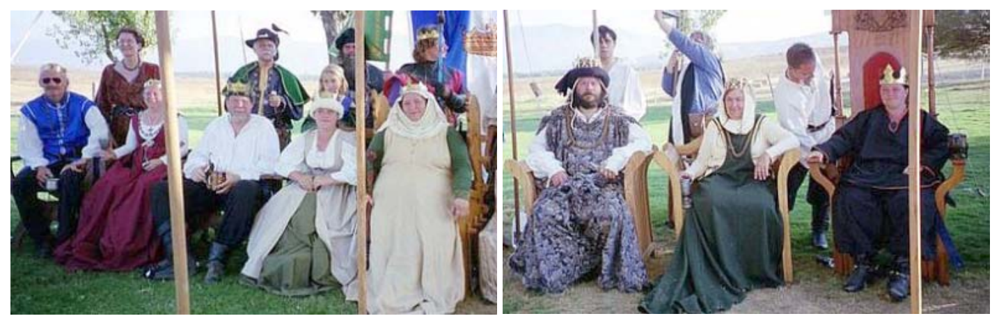
Duke & Duchess of Sangrael, King & Queen of Umbria, Queen of Terre Neuve, King & Queen of Esperance, Queen of Aragon