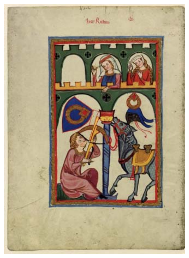
Illuminated page from the Codex Manesse

YIS, Lord Auberon, Imperial Hospitalier reprinted from the hospitaler's e-list