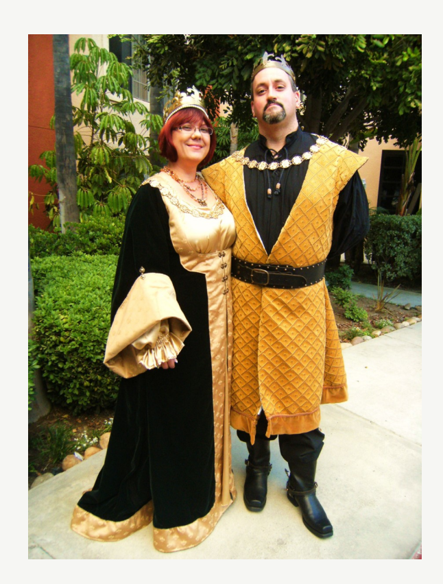
Empress Cocah Anatolii Emperor Hawthorn de Tallyrand-Perigord