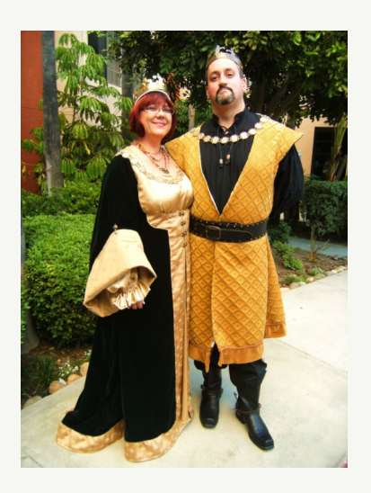
Empress Cocah Anatolii Emperor Hawthorn de Tallyrand-Perigord