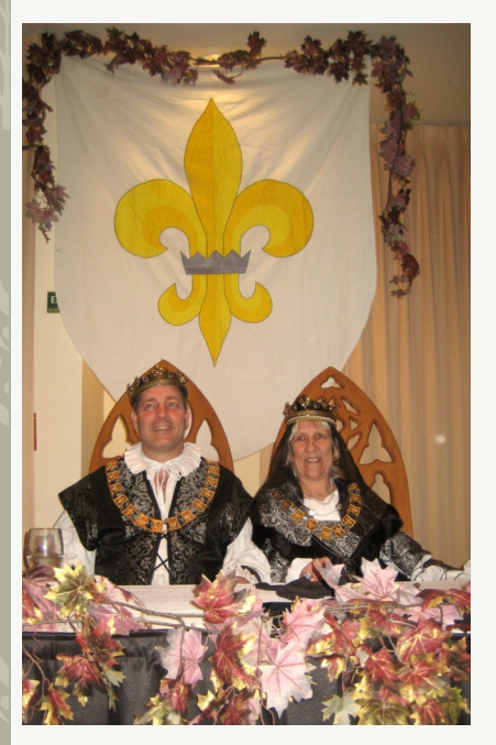
Greetings unto the Empire,

It has been a pleasure to serve you these first two months. Although it saddens Us, and We had hoped to avoid a situation like this during Our reign, We must address a serious matter. A few of Our officers and officials are considered administrators and it is clear that some are unfamiliar with the proper procedures concerning chattel property. There are strict rules concerning self-dealing and We cannot allow Adria to violate them even unintentionally. We, the Imperial Crowns, have consulted with Adrian members that are legal and financial professionals, current Crowns, and several Imperial family members. It has been universally stated to Us by all of these sources that the practices that occurred are unacceptable, both within Adria, and more importantly, mundanely.