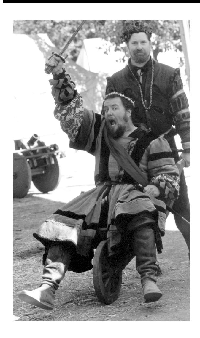
"Ve Commin"

More details will be published prior to the July Meeting of the Imperial Estates along with the candidate letters.