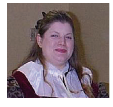
Imperator et Imperatrix, Adria