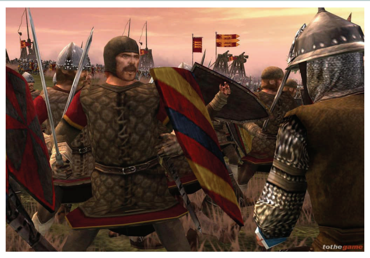
OK this was a trick question...

This image is from Medieval II Total War a soon to be released title from SEGA.