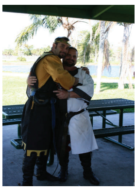
Sir Alaric Q Sir Nikademus