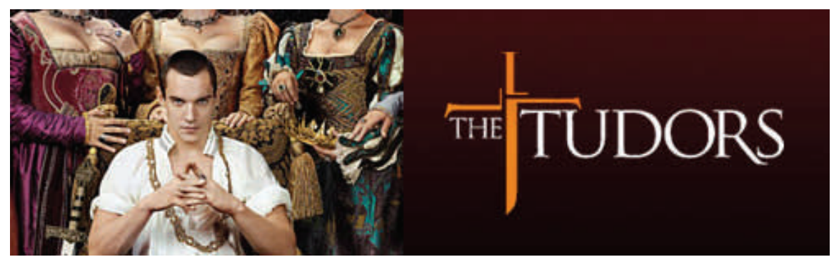
Starts in April on SHOWTIME

Gase became the Minister of Arms. The evening feast was set with the idea of love. All foods were known aphrodisiacs.