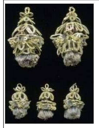
(item T.60 to C-1978)