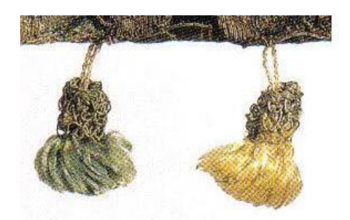
Figure 50 Buttonhole stitch top tassels on a purse made in Paris about 1334 Victoria and Albet Museum

Numerous sources including Elizabethan Costuming and Elizabethan Arts describe purses with multi tassels attached and in Costume and Fashion under 14<sup>th</sup> century Edward II is shown in plate IX and describes on page 215 "a Noble Lady Clothing"… " with gold cord and finishing in a tassel at the end" Also it is noted that Henry VII "wore a steel-blue silk sleeved doublet with braided and with silver, rubies in gold mounts"…"a small white silk sash or scarf is worn which